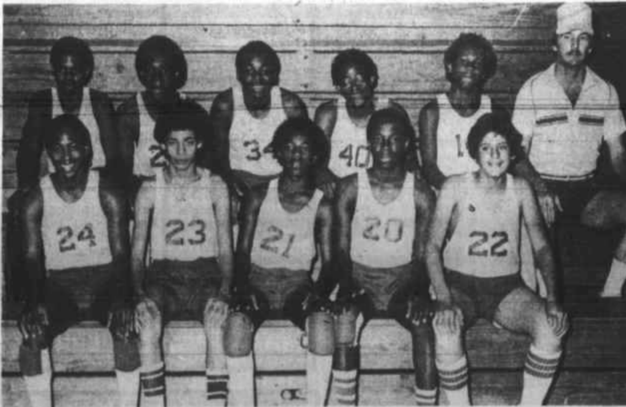
Eagle Lake eighth graders