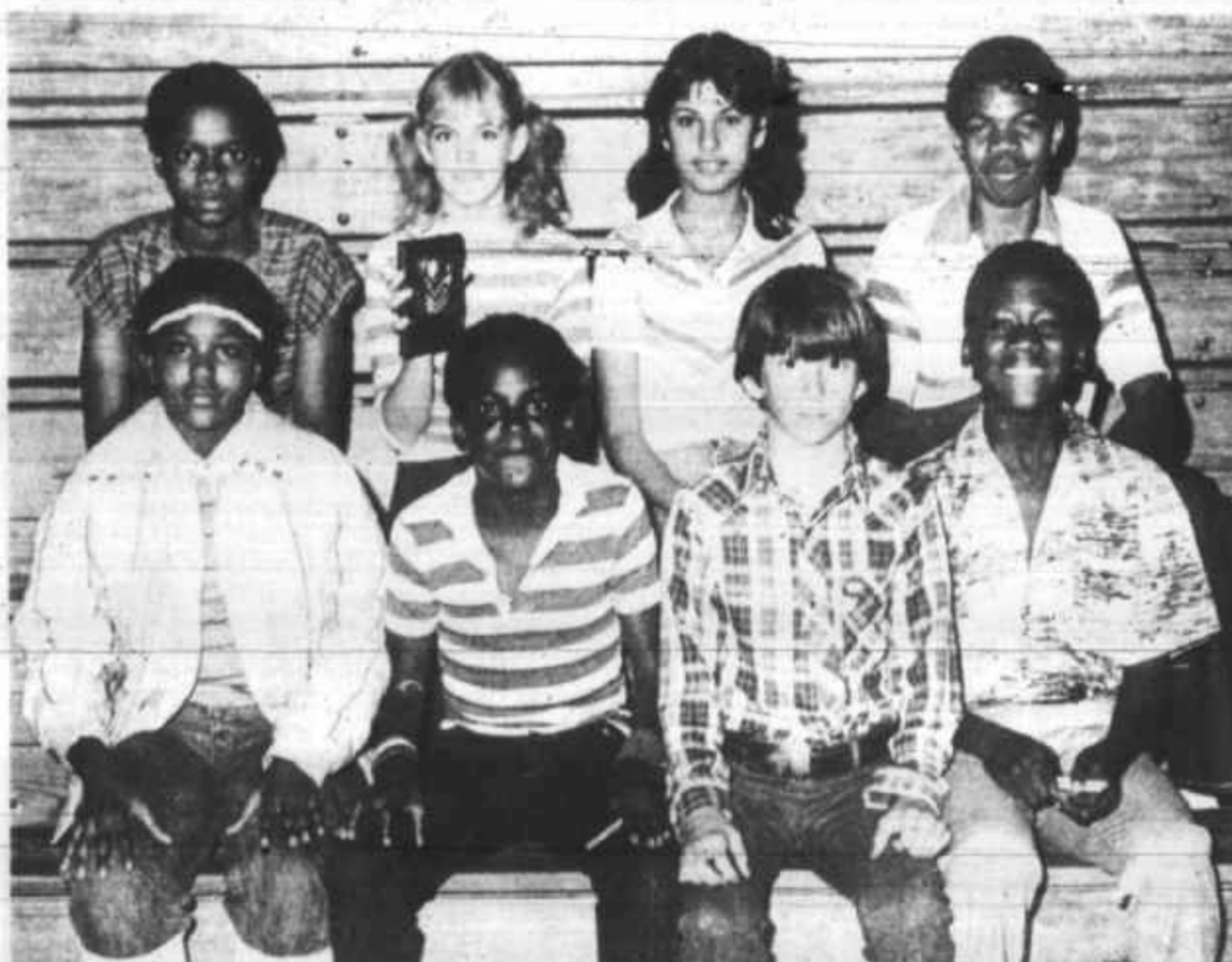
Free Throw winners.